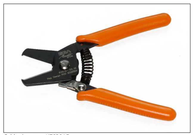
Cable tie cutter HT63915.