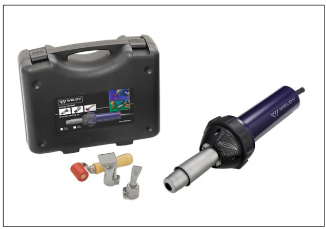
HT1600 Hot Air Tool.