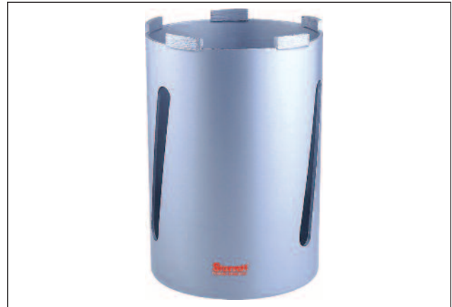
Diamond Core Drill.