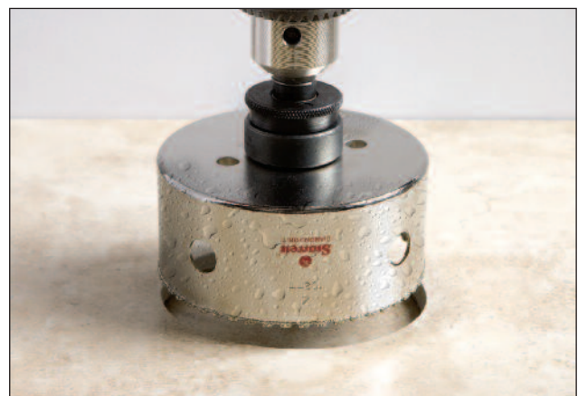
Diamond Grit Hole Saw Application.