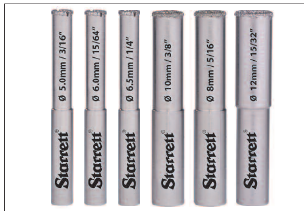
Diamond Tile Drills.