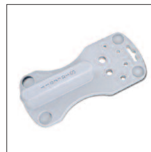
Diamond Tile Drill Guide.