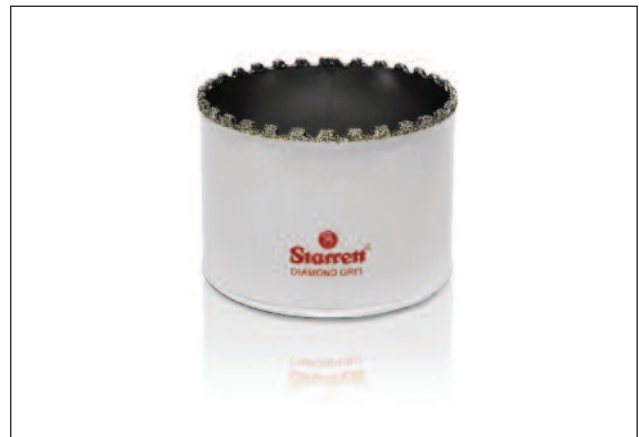
Diamond Grit Hole Saw.