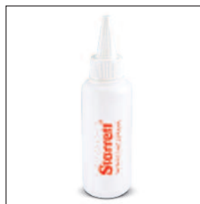
Tile Drill Water Bottle.