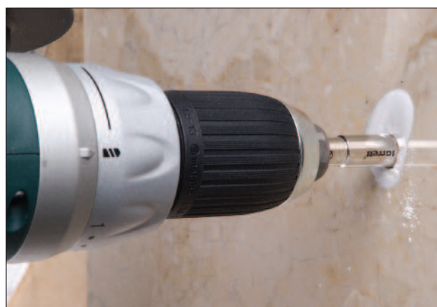
Diamond Tile Drill Application.