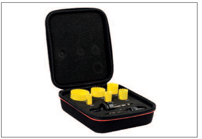
Fast Cut Hole Saw Kits also available. See pg 42