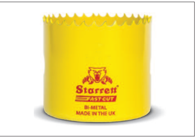
Fast Cut Hole Saw.