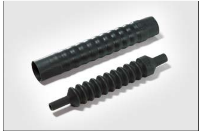
313C722-774 Series supplied / fully recovered.