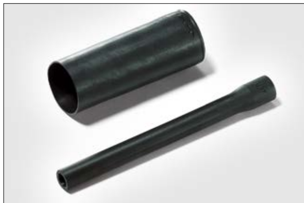
313F322-396 Series supplied / fully recovered.

For Material / Adhesive selection and other information please refer to page 10.