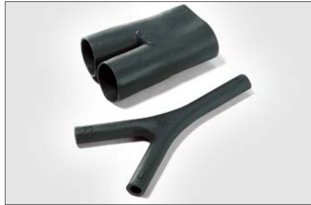
492H412-415 Series supplied / fully recovered.

For Material / Adhesive selection and other information please refer to page 10.