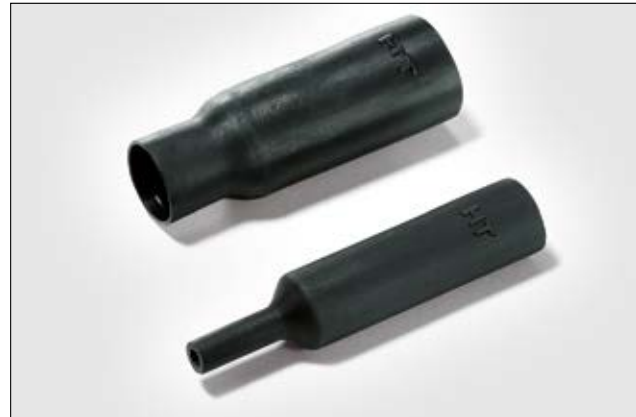
313E445-457 Series supplied / fully recovered.

For Material / Adhesive selection and other information please refer to page 10.