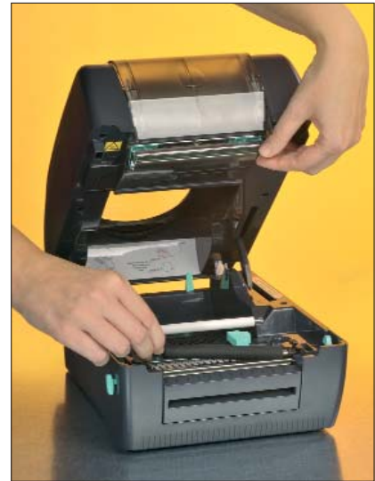
Print heads and platen rollers can be replaced by hand – there is no need for tools.

The 300 dpi print head fulfils all standard requirements for printing bar codes, warning signs, logos and written information. The high quality long-life thermal print head can print 25 km of adhesive labels and is easily replaced by hand without tools.