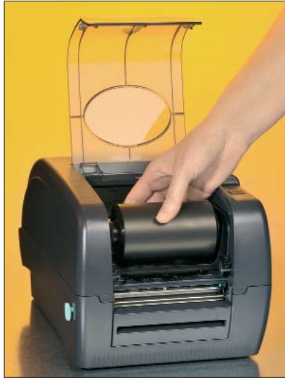
Easy ribbon loading.

The TT420+ is virtually limitless when it comes to suitable applications. It can be used for identification of goods in the logistics area and marking of cables in the electrical industry.